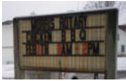
Thanks, WLF D Sign on Route 23 in West Laurens